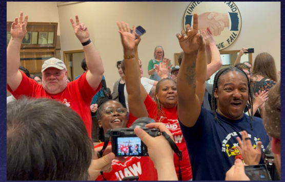
Moment VW Chattanooga workers won their Union

What we saw last week with the American workers' movement is exciting, and watching it unfold in front of us is amazing. We have power as long as we stand together in unity and watch VW workers stand up and now fight for what is right, and that is union representation. The VW workers voted to organize for three days; they have 4,300 hourly workers, and they passed the vote by 73%. The UAW tried to organize in Chattanooga back in 2019 and 2014, and they were unsuccessful. The UAW International has a lot of other companies' workers wanting to stand up, such as BMW AG, Toyota Motor Corp, and Nissan Motor Company AG. A second UAW election will be held at Mercedes Benz Group in Tuscaloosa, Alabama, from May 13th to 17th. It's a great time to be a UAW member, and the non-union workers see this, and they want bigger and better pay, working conditions, and representation. They are tired of always being pushed down and want to STAND UP now and fight. So, instead of standing on the sideline, get involved and make change for us all. Let's keep the workers' movement going. Come out to our local union meeting in May on the 11th at 9 AM.