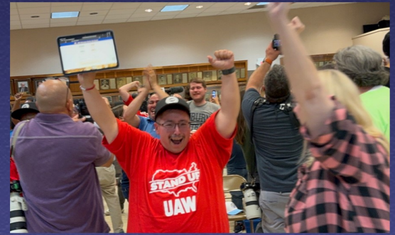
Moment VW Chattanooga workers won their Union