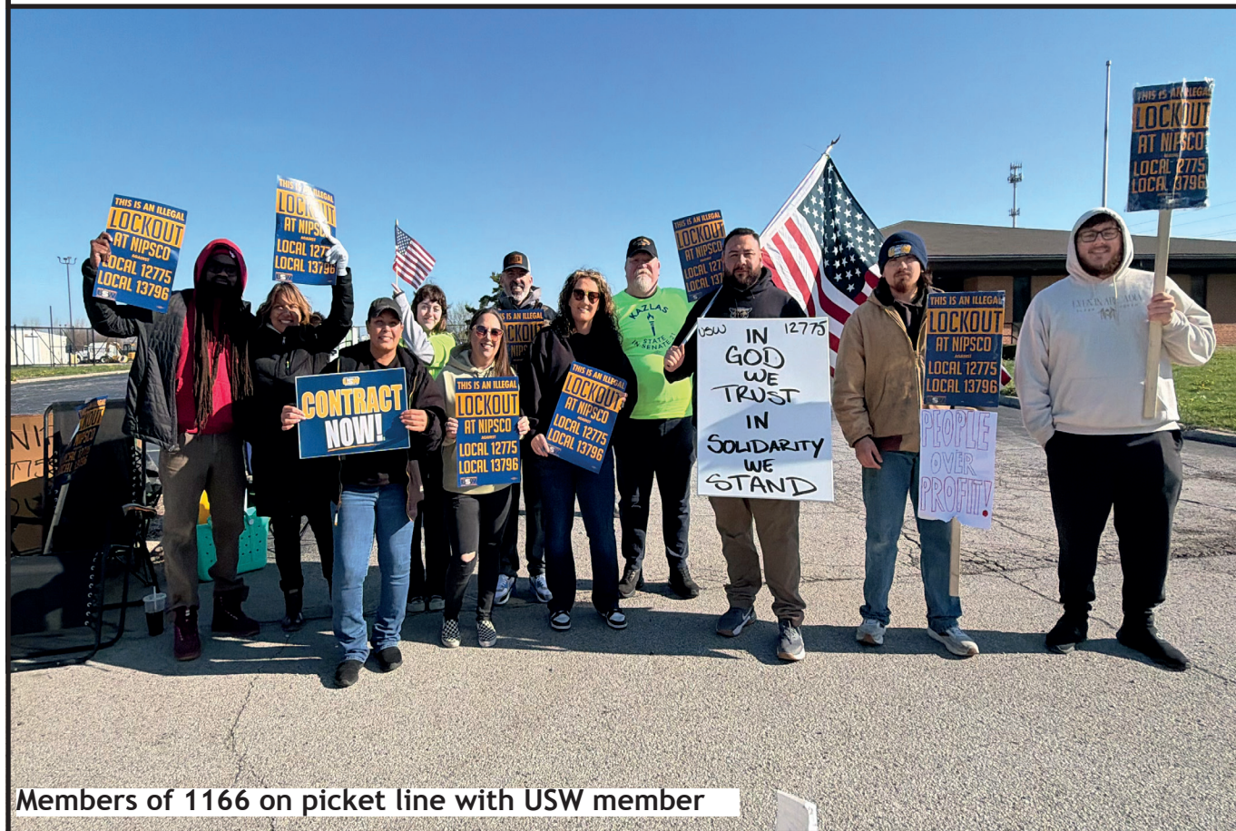
Members of 1166 on picket line with USW member

NIPSCO isn't just going to take on the Steelworkers. They're going to take on all of us.