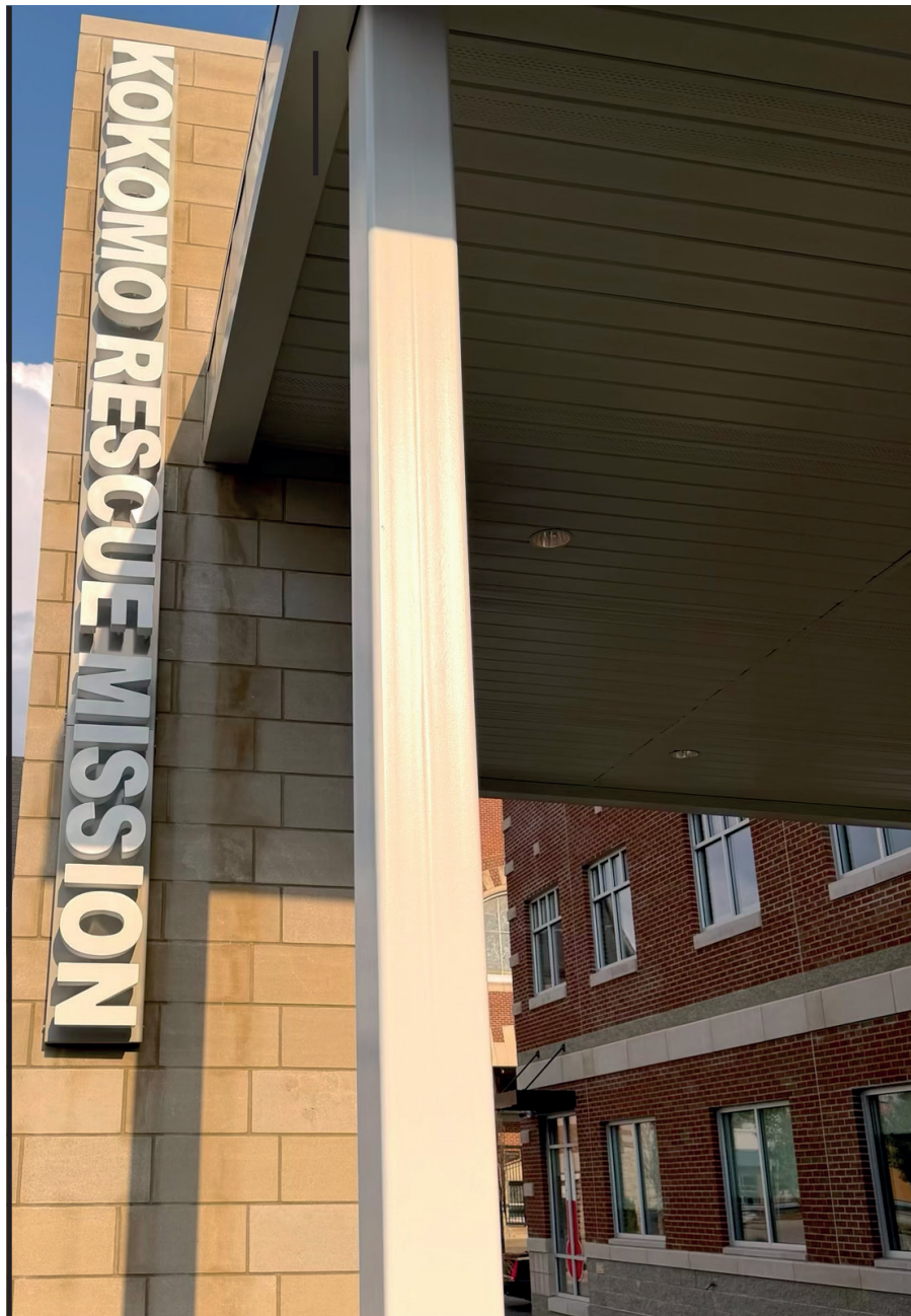
The Kokomo Rescue Mission - Community service members toured the Engagement Center

Members of the Community Service Committee recently had the opportunity to tour the Engagement Center and men's shelter at The Kokomo Rescue Mission. We saw firsthand the impact this organization is making in our community.