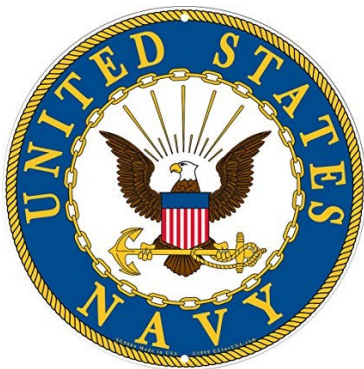
Cliff Decker Navy